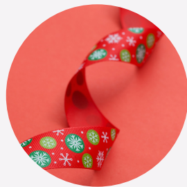
Pretty Ribbon + Stickers (avoid bows as boxes are usually stacked)