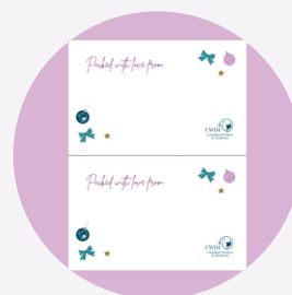
CWIM Note Cards (consider printing on cardstock)