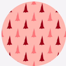
Beautiful Holiday Wrapping Paper